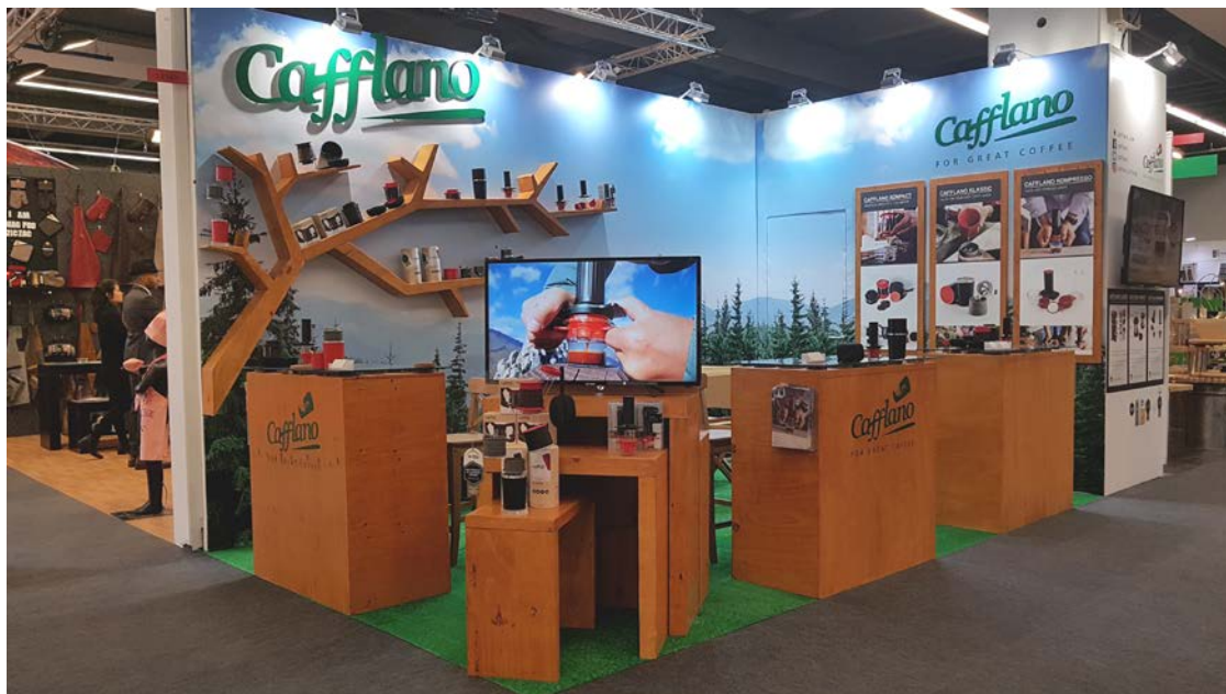
Cafflano Stand at Ambiente 2018 (not good enough!!!)

As our portable coffee makers address quality coffee anywhere, the outdoor background (or home café) could be ideal for our booth concept. We tried the outdoor concept last year (refer to below photo), but not good enough and we aim to have better design for Ambiente 2019. We can provide various images of our products being used outdoors.